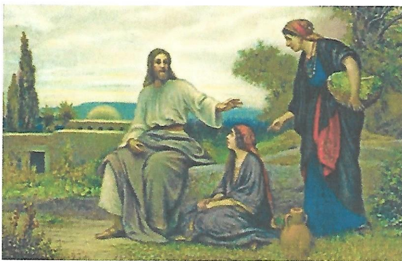
Jesus with Mary and Martha. Detail of Domenico Beccafumi

In telling the story of Jesus' visit to his women friends in today's Gospel, Luke underlines the importance of the guest: Martha addresses Jesus as Lord, while Mary sits at the Lord's feet. This is not a casual visit. In response to Jesus' presence, Martha becomes fully engaged in preparing a meal while Mary becomes fully engaged in listening to the Lord. The scene of Mary sitting with her guest is a world away from the religious practice of the day: women were not instructed in the Law by the rabbis because they could be neither a teacher