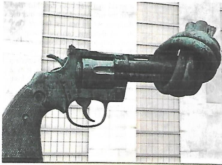
"Nonviolence" ("knotted gun") sculpture by Carl Fredrik Reuterswärd

In December 1918, United States President Woodrow Wilson sailed to Europe to attend the Paris Peace Conference. He would spend the next six months in France, together with many of the leaders of the world's nations, as they attempted to bring a settlement and an end to the Great War that had destroyed so much during four years of fighting. Landing in the port of Brest, Wilson took a train for Paris. As the train steamed through the night, Wilson's doctor woke up and, looking out of the window at two in the morning, he saw people lined up along the track. They had come out to watch the train pass by, for on that train they saw not only the American President go by but, travelling with him, their hopes for a better world.